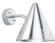
Hot Dip Galvanized Steel