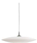
Galilei 35 P1 240V